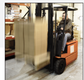
Narrow aisle forklifts